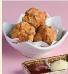
TORI KARAAGE $3.5 鶏唐揚げ Fried chicken thigh