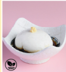
JIMAMI TOFU $2.8 ジーマーミ豆腐 Okinawan peanut tofu