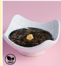
MOZOKU SU $2 もずく酢 Okinawan seaweed in vinegar, topped with grated ginger