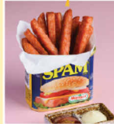
SPAM FRIES $6.8 スパムフライ Fried luncheon