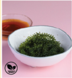
UMI BUDOU $3.8 海ブドウ Sea grapes with ponzu sauce