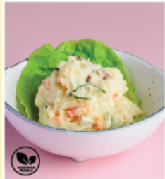
POTATO SALAD $2.8 ポテトサラダ