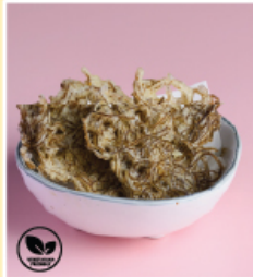
MOZOKU TEMPURA $2.8 もずく天ぷら Fried Okinawan seaweed